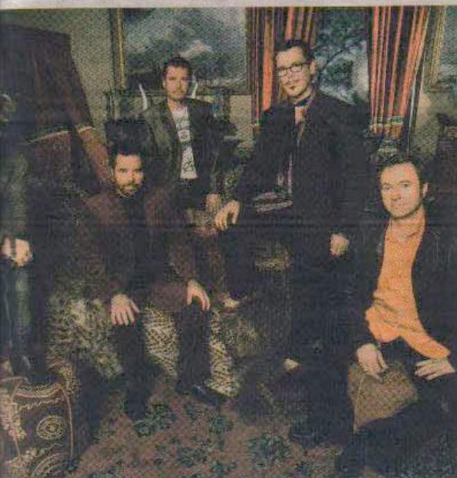
Andrew Farriss, Jon Farriss, Kirk Pengilly and Garry Boers search for their new lead singer

Four Canadian hopefuls are among 15 international contenders vying for the empty spot of lead singer for the famous rock group