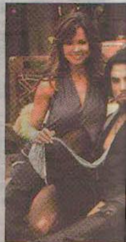
Rock guitarist Dave Navarro (formerly of The Red Hot Chili Peppers) and Brooke Burke will host Rock Star: INXS on CBS and CH three

Rock Star: INXS debuts Monday at 9 p.m. on CBS and CH and also airs Tuesdays at 10 p.m. (a one-hour performance episode) and Wednesdays at 9:30 p.m. (a half-hour results show). Beginning next week, Monday's episode (home life show) will air at 9:30 p.m.